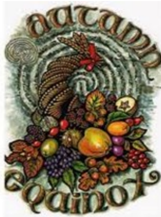
Google images 9/22/14