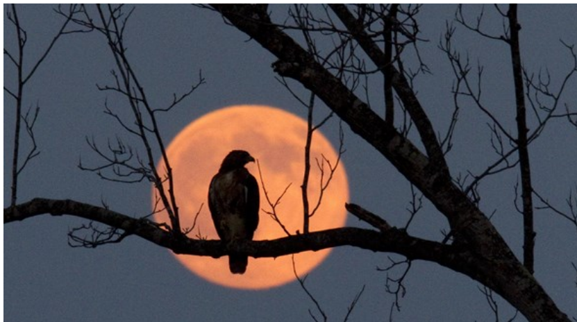
Google images 9/22/14